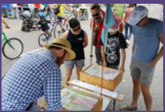
Participants scrolled through Crankies at Open Streets - Lake + Minnehaha.